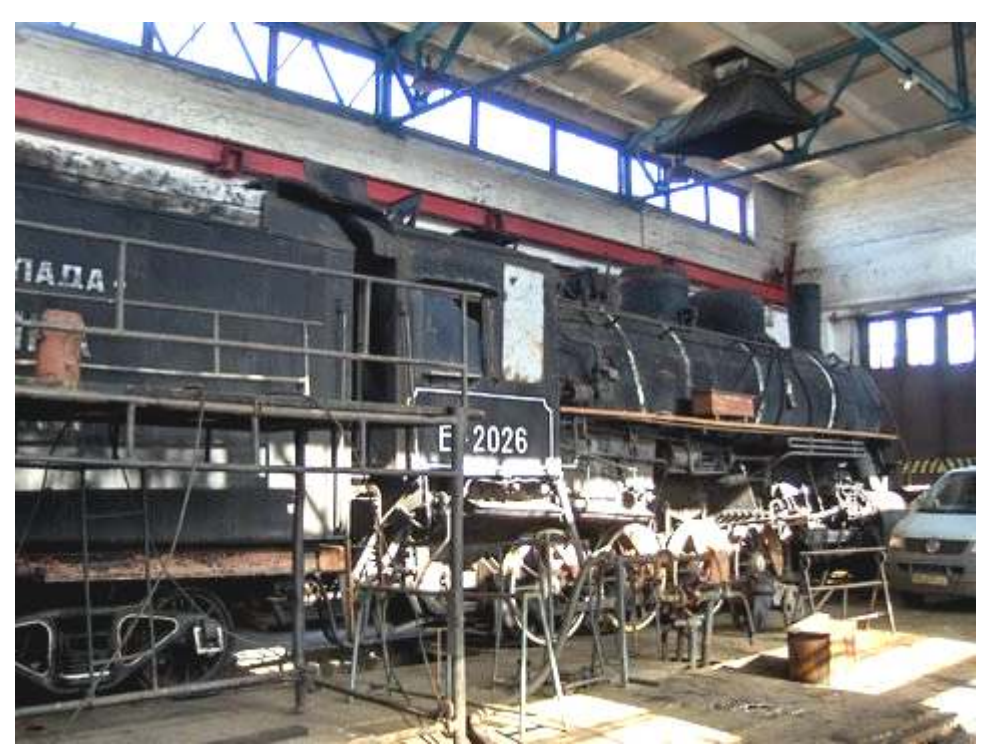
The ALCO 2-10-0 awaiting restoration in the Tsvetkovo workshops.

Ukraine, in 1955); and freight 0-10-0 Em735-72 (Built by the Kharkiv factory, Ukraine in 1935). There is also a variety of passenger and freight cars awaiting restoration, including a Fourth Class two-axle suburban passenger car built in