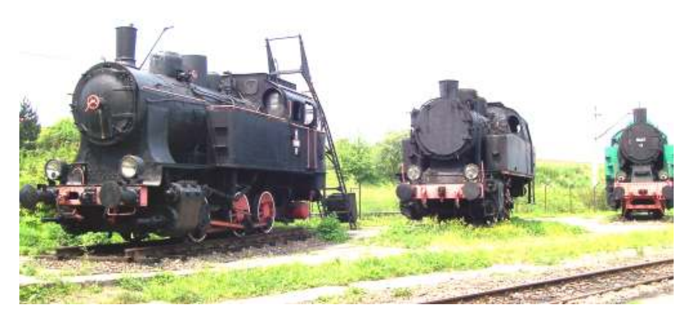
At Chabowka six years ago.

Lines and Museums under some long-term threat include the Chabowka Railway Museum, run by PKP Cargo and threatened by Cargo's increasingly commercial approach and imminent privatisation. Its transfer to the provincial government is snagged on property-title difficulties. Then there are the Gniezno Narrow Gauge Railway and the Smigiel Narrow Gauge Railway (currently being asset-stripped by its local authority owner). The Karsnice Railway Museum has been successfully taken over by the Zdunska Wola Council, thanks to energetic lobbying. A meeting between David Morgan and the responsible minister was very important in this regard. However, PKP SA did not transfer the shed in which a historic train of wooden coaches was stored, and the vehicles are rapidly deteriorating. The Koszalin Narrow Gauge Railway is in dispute with the local mayor with respect to the operation of its trains across level crossings. A plan for a local-authority-led consortium to form a company to manage the Wolsztyn Steam Depot (also part of PKP Cargo) has floundered because of differences over funding.