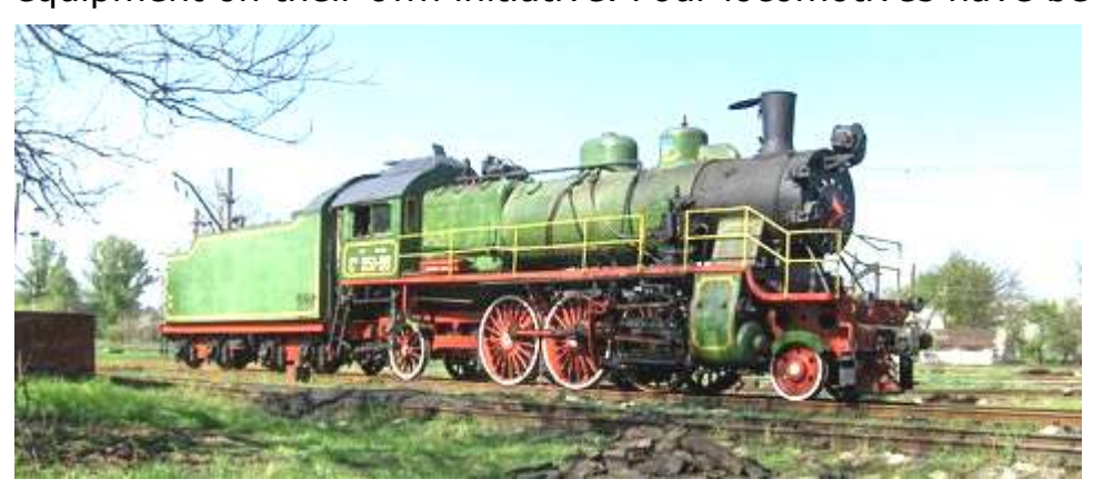
No Su251-86 after restoration

Since 2008 AZIZU has sent about 75 official letters, the contents of which in one way or another were connected with the preservation of old rolling stock. Some of these letters are assumed to have helped ensure that work began in 2010, to establish a museum of the South-Western Railway in Kiev. At the same time, in 2010, the Directorate of Ukrainian Railways ('Ukrzaliznytsia') began preparations for the establishment of Kiev's freight station, Kiev Tovarniy, as a state museum of Ukrainian railways. But due to a change in leadership in the Directorate, work on this was unfortunately suspended. Even before the official registration of AZIZU, members of the organizaton, having known each other for some time, decided to buy and restore old railway equipment on their own initiative. Four locomotives have been preserved in