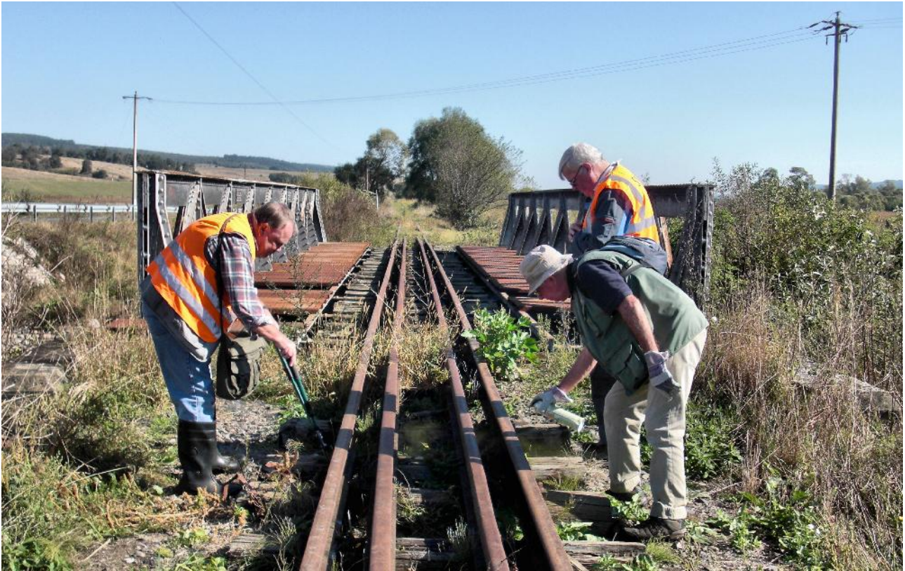
On the SAR, track inspection at Cornatel river bridge