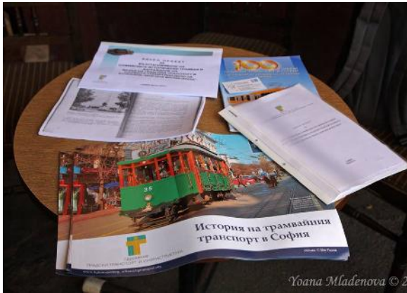
The Association's publications on display

assuring him that the museum will be a place to exhibit handmade models.