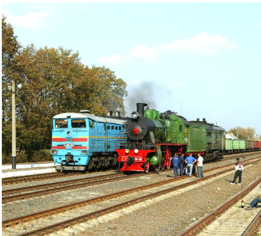
Cy 251- 86, on trial after restoration in 2011, is passed by a mainline freight train.

Also in 2014 the shunting diesel locomotive TGM3A 1129 was acquired, and four narrow-gauge wagons from Kirovograd oblast.