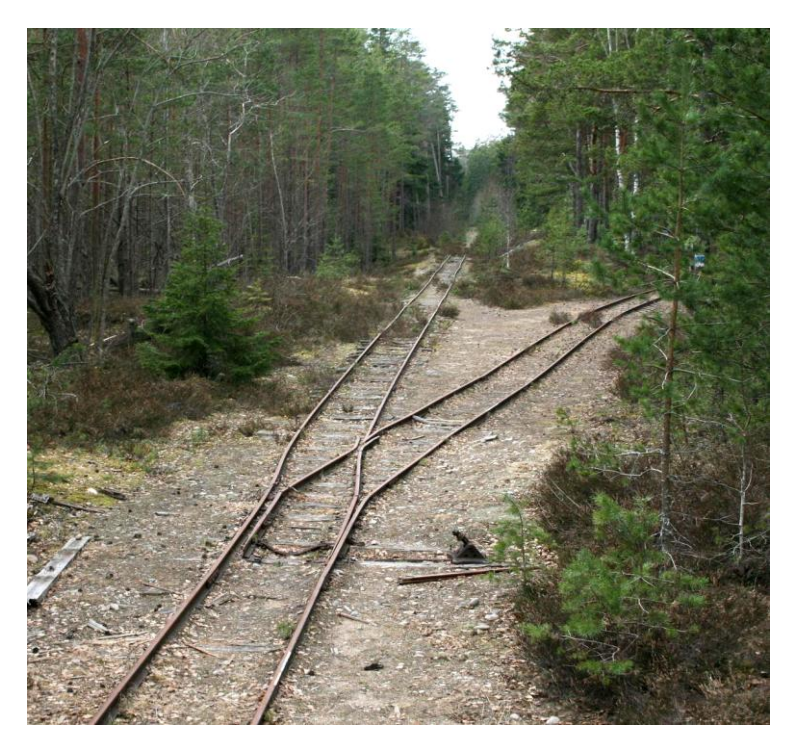
A 2011 view of the trackage.

After 1918, the Estonian Republic used Naissaar as a naval base. In 1934, 450 people lived on the island; 291 were Estonians, mostly army personnel, and the rest fishermen of Swedish descent. The army of the Republic of Estonia continued to use the railway for military purposes throughout the 1930s. The existing locomotives were designated numbers 3 (the 0-6-0) and 4 (the 0-6-2). After a brief period of Soviet control in 1940-41, the island came under German occupation once more. The railway system functioned with the original locomotives until the Summer of 1944, when the retreating Germans removed Number 4, the Finnish 0-6-2. However, it was left behind in Estonia, where it worked on the mainland narrow gauge system until it was scrapped in 1953.