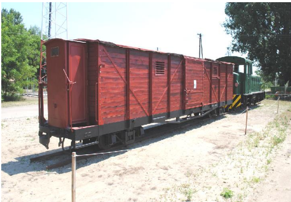
The restored rolling stock at Domaszek, Hungary, mentioned in our last issue.