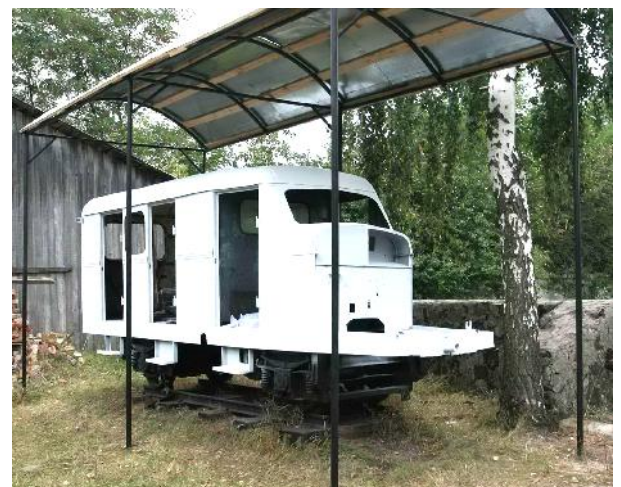
An AZIZU project in Ukraine: a PD-2 draisine in course of restoration at Antonivka. Photos: Wolfram Wendelin