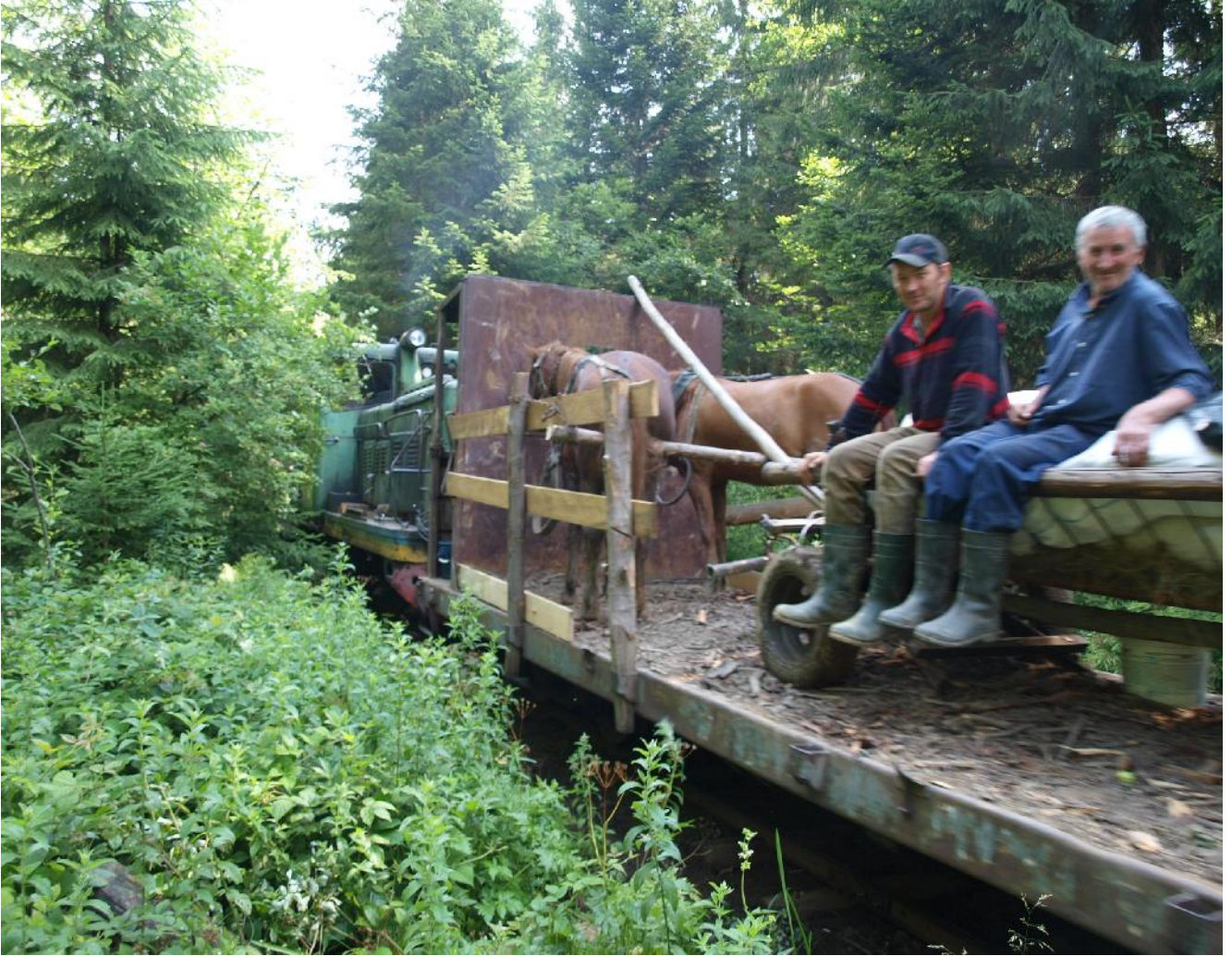
The Vyhoda Railway is still serving its local economy: a recent picture