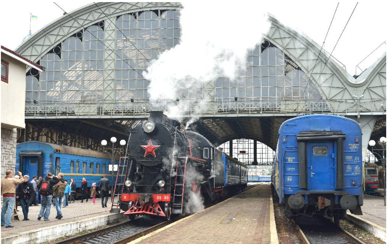
Readers of our previous issue may recall the advance notice of two steam runs arranged for September. These duly took place, as evidenced by these pictures supplied by Wolfram Wendelin. The broad-gauge L-3533 is seen above, at L'viv, and the lower picture shows narrow-gauge Gr-280 at work on the Gaivoron (Haivoron) line.