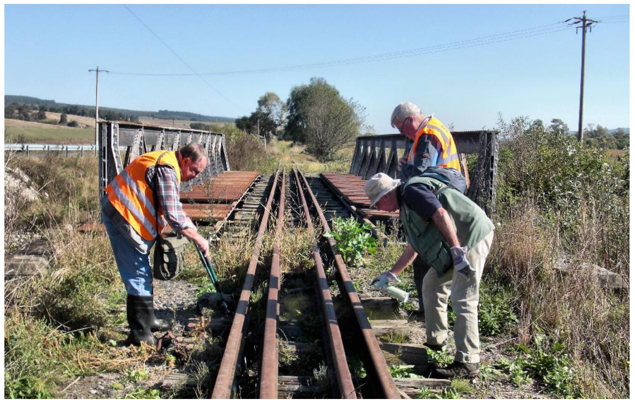
On the SAR, track inspection at Cornatel river bridge