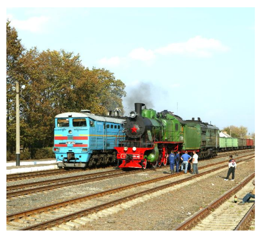
Cy 251- 86, on trial after restoration in 2011, is passed by a mainline freight train.

2013 – In April three AZIZU members made a study tour, sponsored by NERHT, to UK Museums and preserved railways. On 17 May Cy 251-86 took part in the 150-year anniversary celebration of the start of construction of the Odessa Railway. A special train ran a circular trip around Odessa. During the summer there was the shooting of a TV serial at Zvenigorodka. and two more return trips between T,Shevchenko and Zolotonosha. 2014 - Trips of Cy 251-86: on 2nd May and 2nd August there were return trips between T.Shevchenko and Zolotonosha and on 24th August there was the first trip between Tsvetkovo and Khristinovka (300 km return). Also in 2014 the shunting diesel locomotive TGM3A 1129 was acquired, and four narrow-gauge wagons from Kirovograd oblast.